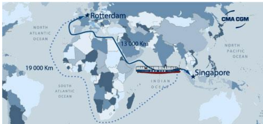
Map 1: Suez Canal vs. Cape of Good Hope maritime route